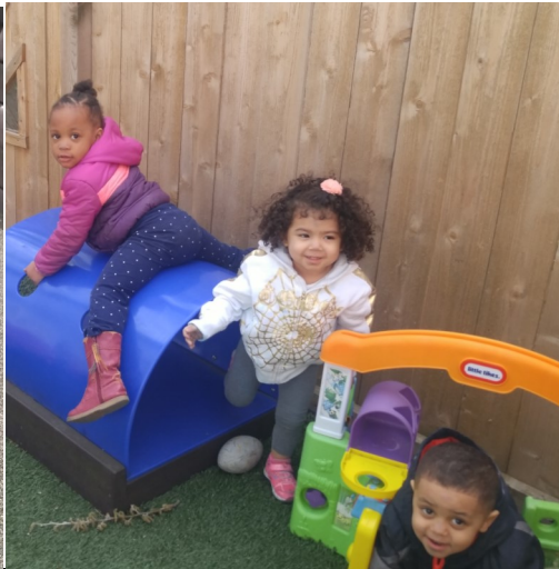
Some of our children enjoy a sunny Spring day in the back playground at the Baby Toddler Nursery