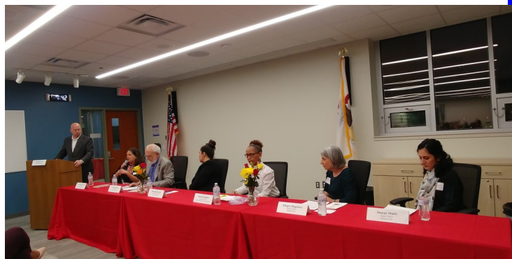
Our Panel Discussion at the IWSE and District 69 Symposium was a huge success.

We look forward to developing our partnership with School District 69 and advancing the work of Early Childhood Education and promoting a continuum of care from 6 weeks to 5 years old.