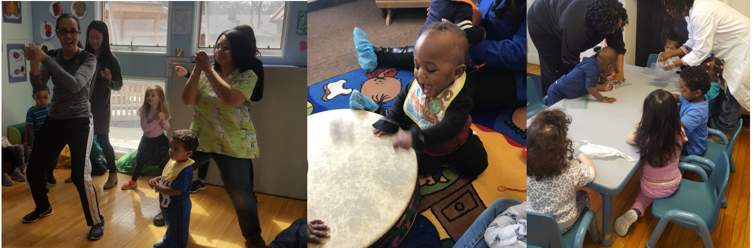
Zumba with our TB3 Pre K classroom was a blast, music activities at Teen Baby Nursery and creative arts and crafts in our Eagle 2 Toddler room

One of the activities that we did as a larger early childhood community in Evanston was “ stop, drop and read” where we took 15 minutes at 10:30 am and stopped everything we were doing and read with our children. This was happening in dozens of child care facilities with hundreds of children at the same time. It was a great week for all of us to enjoy and celebrate.