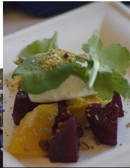
Warm Your Palate guests cheer on the auction. IWSE staff enjoying the evening. A sample of great Chef inspirations.