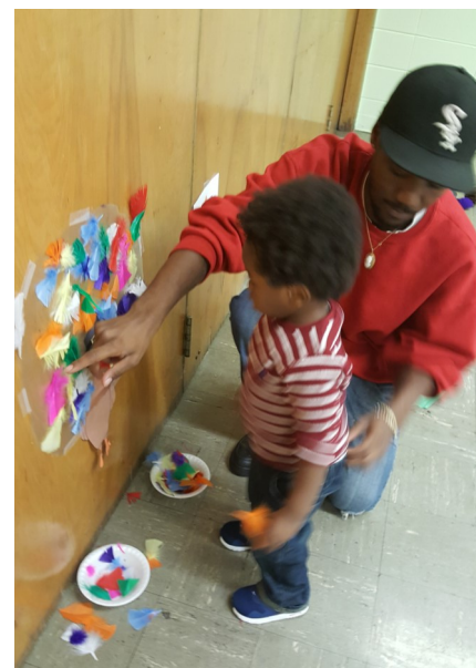
Dad helps with a wall art project

Paint your own Pumpkin place-mat, Pine Cone Bowling, Pin the Feathers on the Turkey, and for a sweet treat, Make your own Taffy Apples. The families had a wonderful time eating and getting to know the other families in the center. The next event will be a Winter Wonderland Celebration which parents are already looking forward to attending.