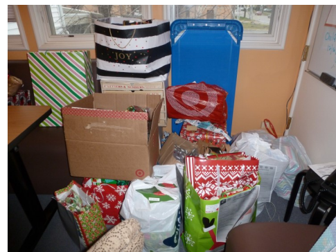
Presents gathered for Family to Family

Every year IWSE reaches out to our community requesting support for families that may need presents and holiday gifts for their children. We create a list of interested families and match them with donor families to fulfill a holiday gift wish list. All of our families give the ages of their children and their wish list for presents. Names are kept anonymous. A few weeks before the holidays we start collecting the gifts and distributing them to our parents and families. It is a wonderful way to let families share their blessings and allow others to feel the joy of having enough gifts to give their children. We thank everyone who participates and helps to support this wonderful program at IWSE.