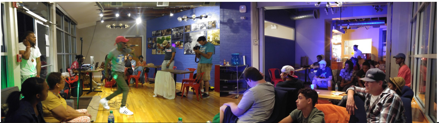
Open MIC night at Gibbs-Morrison Center sponsored by Evanston Community Foundation, IWSE and the City of Evanston