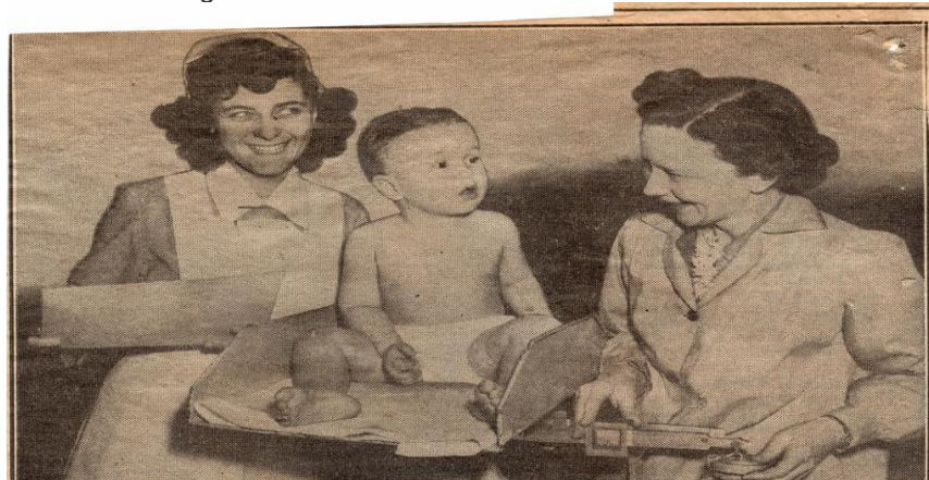
Infant Welfare Volunteers Celebrate Baby Week Year Around