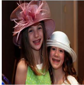
Young guests at the 2011 Hat Tea

The Infant Welfare Society of Evanston (IWSE) will be holding its seventh annual Hat Tea fundraising event on Sunday, May 6, 2012 at the Hilton Orrington Hotel from 3-5pm. The Hat Tea invokes the roots of the 99 year old organization, which was founded by an all-woman board, and is a wonderful opportunity for multiple generations of daughters and mothers to spend the afternoon together. All proceeds from the event will benefit IWSE's programs providing high-quality early childhood education and family support services for teen parents and low-income families with young children in the city of Evanston and the surrounding communities.