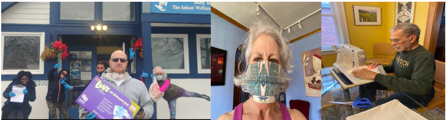
Pictured: Staff providing hard-to-find supplies, IWSE volunteers make masks for the families & staff!

Please search IWSE Emergency Fund on www.GoFundMe.com to support our initiative.