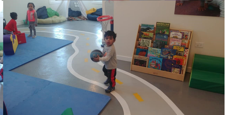
Children Playing in The New Tom Kendall Gross Motor and Play Space!